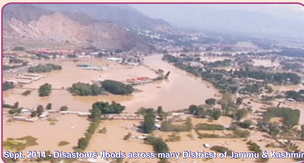
Sept. 2014 - Disastours floods across many Districst of Jammu & Kashmir